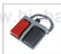
Foot Switch Adjust front window height by foot during experiment, to avoid airflow turbulence caused by arm movement.