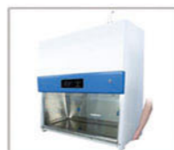
Cabinet Support Block Easy to lift, prevent hand pressing