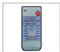
Remote Control All functions can be realized with it, making the operation much easier and more convenient.