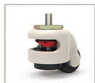
Footmaster Caster Universal caster with brake and leveling feet.