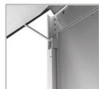
Iron hook support rod for panel support