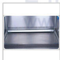
Work Zone Work zone, made of 304 stainless steel, is surrounded by negative pressure.